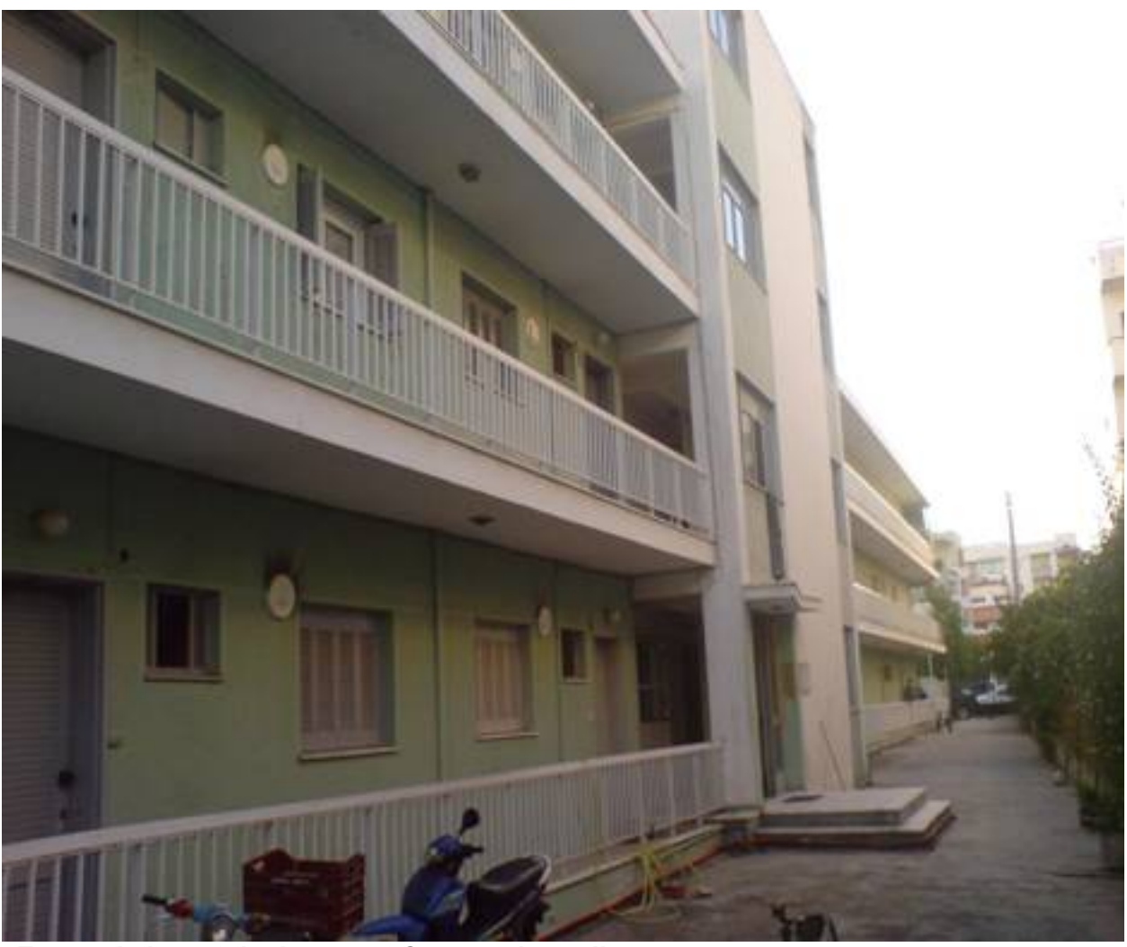
External view of the house of Constantinopolitans

During the last years efforts has been done by the Foundation administration to organize a preemptive medical care for the 50 guests of the House of Constantinopolitans. The recent crisis in Greece has also affected the guests of the Foundations and efforts are being done by the administration to guarantee food provision which most of them are families. Otherwise no state subsidy or support is received.